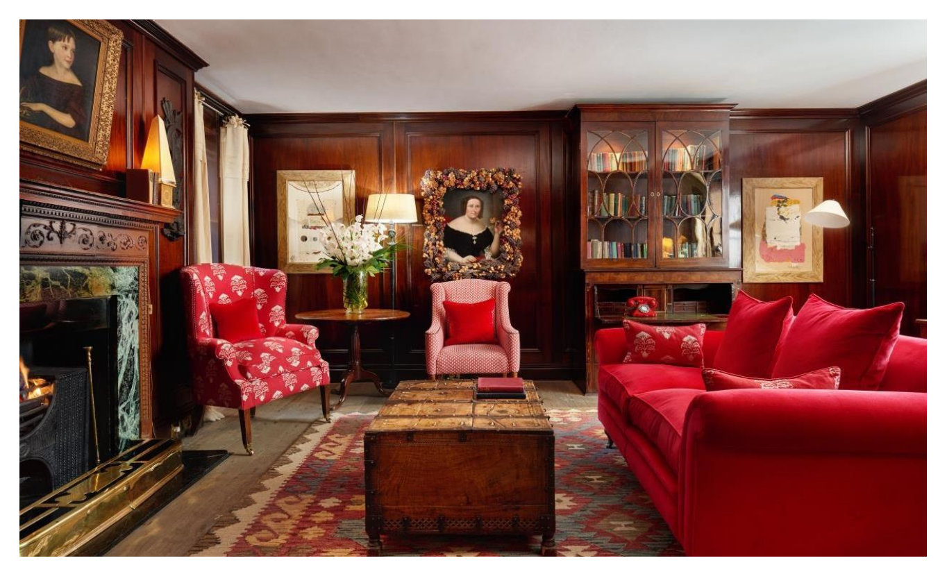
The perfect location in South Kensington's vibrant neighborhood

The Pelham is set right in the heart of South Kensington's vibrant neighbourhood, a short walk from Kensington Gardens, offering the perfect spot from which to enjoy its array of dining, drinking and shopping options. Located opposite South Kensington underground station – directly connected to Heathrow airport – and a few stops from Piccadilly Circus and Oxford Street, it's the ideal starting point for discovering the Victoria & Albert Museum, The Natural History Museum or The Royal Albert Hall.