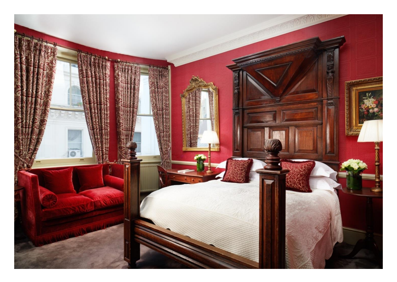
Queen Victoria Junior Suite

The Queen Victoria Junior Suite represents a tribute to Her Majesty Queen Victoria. With its delicately embossed vermilion wallpaper, adorned gilded mirrors, delicate curtains, four-poster carved-oak bed and wooden bureaus, it is modelled after the interiors of Buckingham Palace, where the young monarch was the first to establish her residence after the coronation on June, 28<sup>th</sup> 1838.