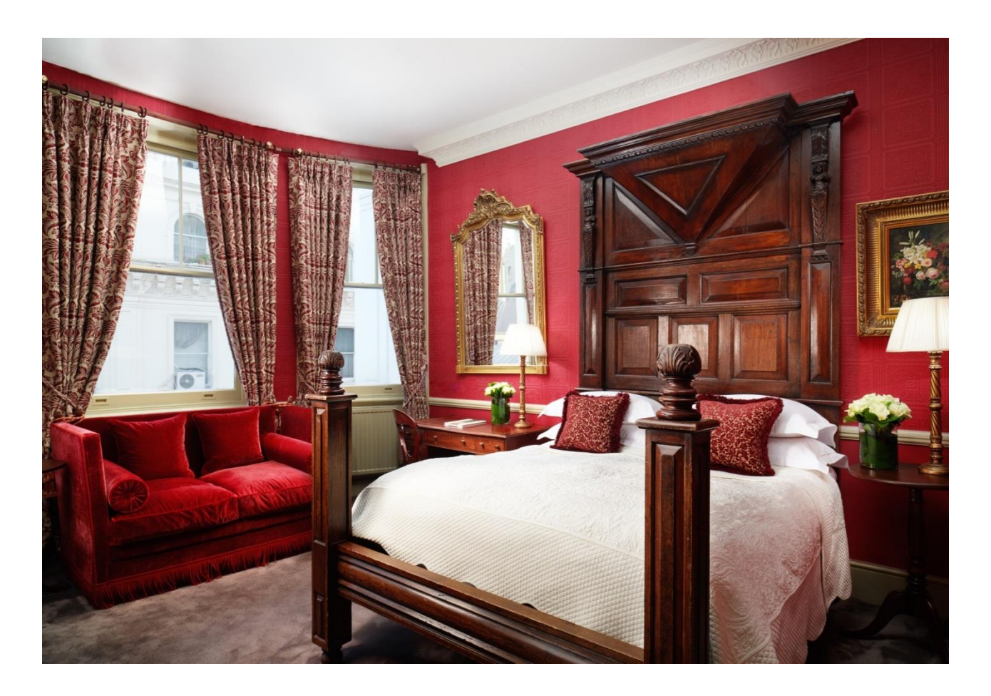
Queen Victoria Junior Suite

The Queen Victoria Junior Suite represents a tribute to Her Majesty Queen Victoria. With its delicately embossed vermilion wallpaper, adorned gilded mirrors, delicate curtains, four-poster carved-oak bed and wooden bureaus, it is modelled after the interiors of Buckingham Palace, where the young monarch was the first to establish her residence after the coronation on June, 28<sup>th</sup> 1838.