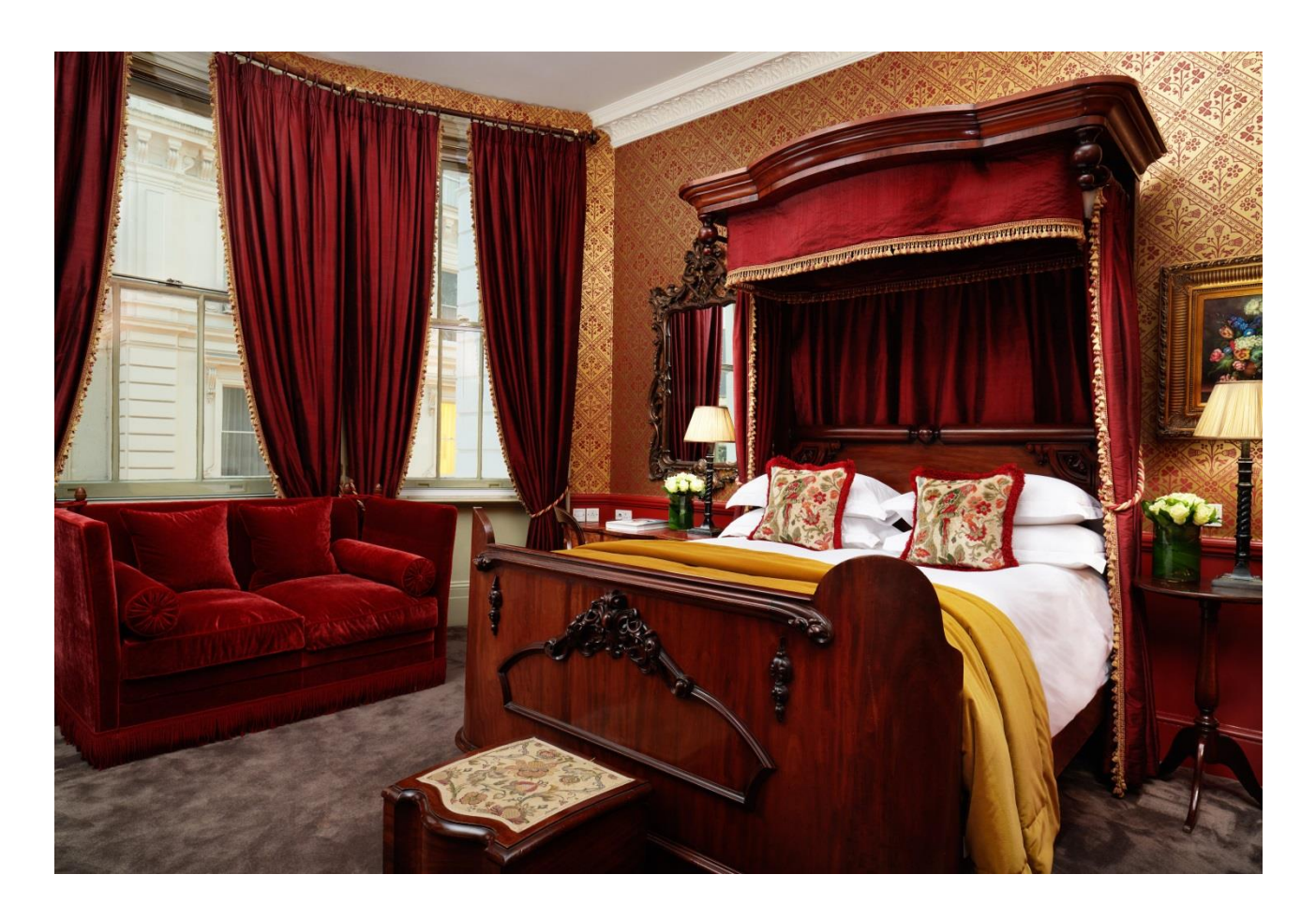
Queen Elizabeth Junior Suite

The Queen Elizabeth Junior Suite is named after Her Majesty Queen Elizabeth II. The colour palette, dominated by red and gold, the mouldings and period details, like the impressive carved-oak canopy bed, the red velvet roped curtains, each carefully contributed to the creation of a truly royal ambience.