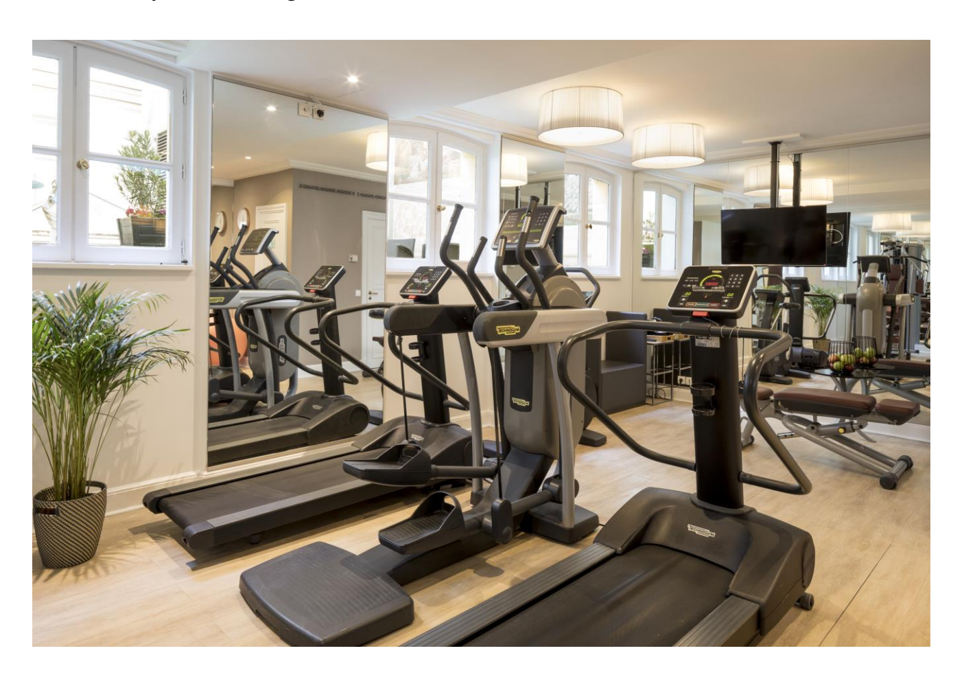
Les moments Bien-être: Moments of wellness at Castille

The Castille's fitness center, equipped with state of the art appliances and machines, is specially designed for guests who do not want to renounce their physical wellbeing just because they are traveling.