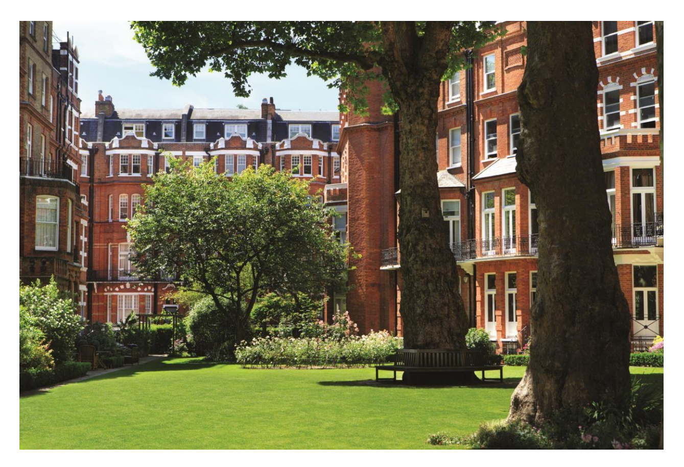
A stunning location overlooking Egerton Gardens

The impressive location in the heart of Knightsbridge, the lavish interiors and the quintessentially Italian hospitality have cemented The Franklin London - Starhotels Collezione as one of the most outstanding 5-star hotels in London.