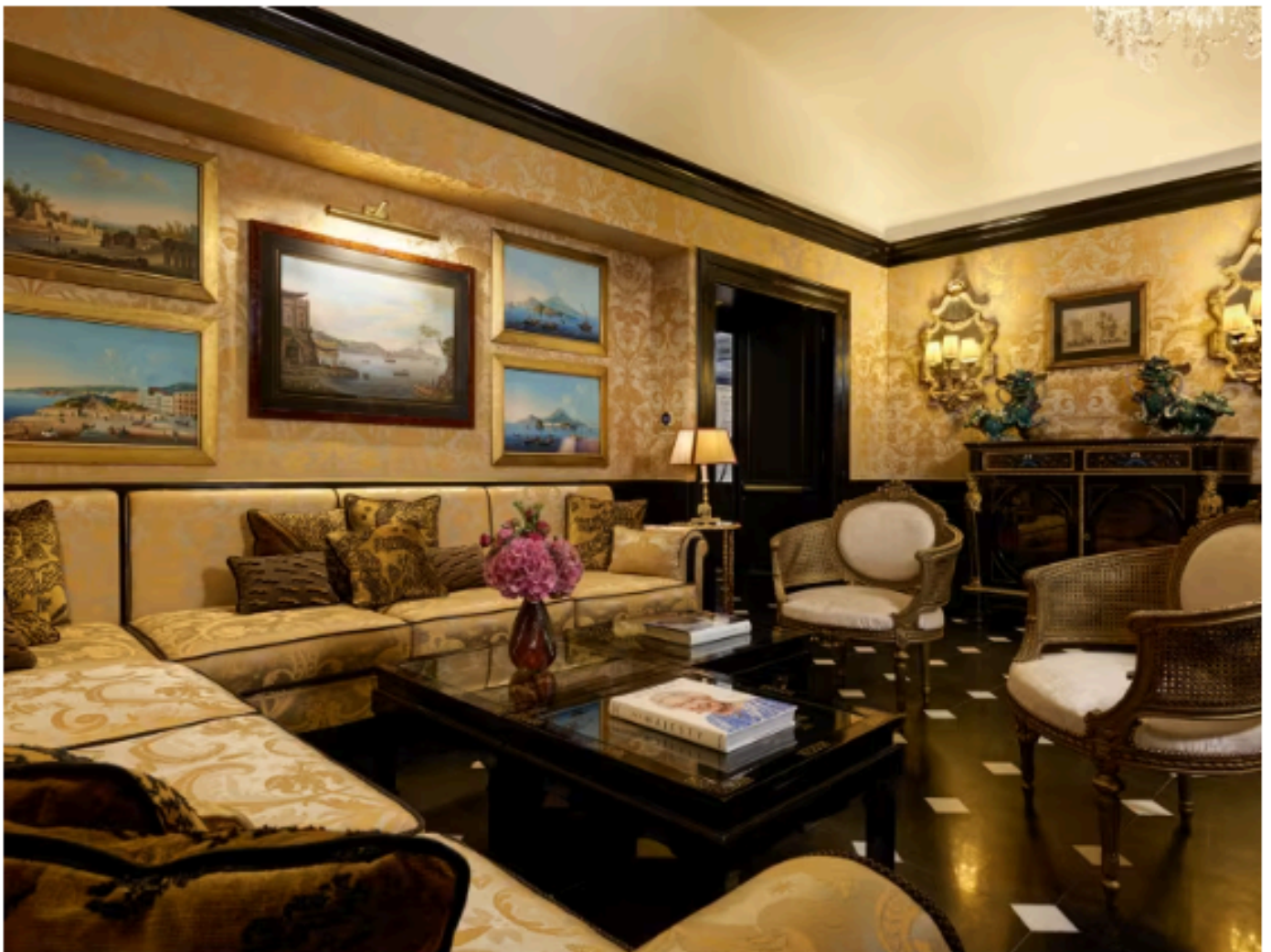
While the interiors at Hotel d'Inghilterra are unabashedly grandiose, the service is incredibly personal.

Made for: Flamboyant guests seeking a cinematic Roman holiday