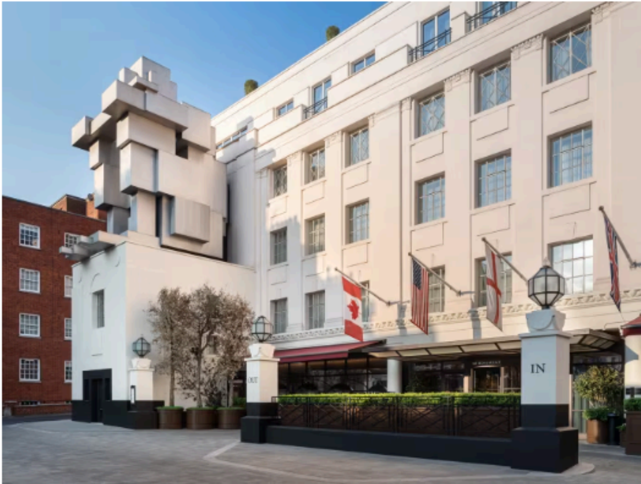
The building that houses The Beaumont Mayfair was once called Macy's — the city's first purpose-built garage.

Made for: Art Deco lovers who adore old-school hospitality