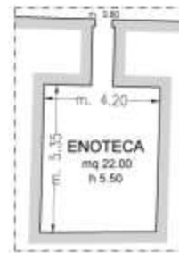
Piano -2 / 2nd Basement