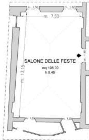
Piano Primo / First Floor